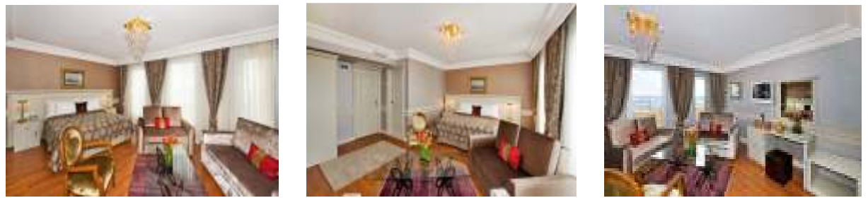
King Rooms are at the top of building and biggest room at the Ferman Hotel. The privilege of