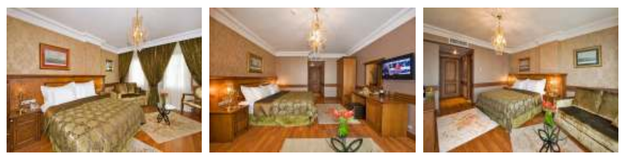
Ocean's room are looks directly Marmara Sea, Princes Islands, Asian side namely you will fascinate from the view of the Marmara. These rooms are bigger than the other room type. The rooms at are a graceful blend of past and present, designed in the Ottoman style yet